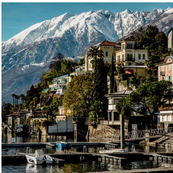
Ascona, Ticino, winter panorama